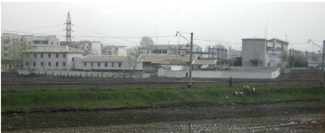
Figure Anju-V. Sinanju (North) (2012)