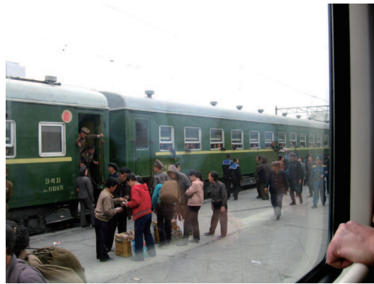
Figure Anju-IV. Sinanju station (2012)