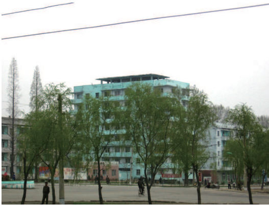
Figure Anju-III. Sinanju (2012)

Sinanju became a victim of violent US-bomber attacks during the Korean War, due to the railway bridges over the Chŏngchŏng-gang.