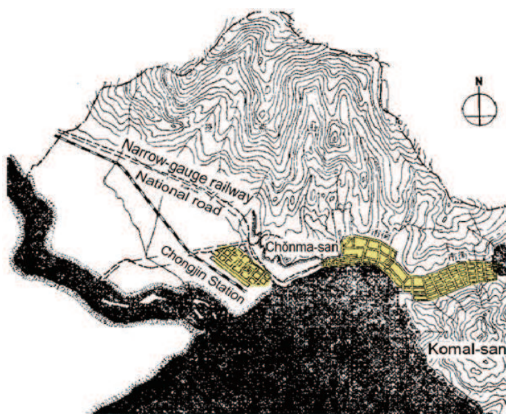
Figure Chongjin-I. Chongjin around 1915

At first Chongjin was nothing more than a small fishing village, which was developed close to a foothill within the county of Puryong. In the First Sino-Japanese War (1904-1905) Chongjin was used as a landing place for military equipment of the Japanese, and during that time the village counted around 100 houses. During this war, the Japanese promoted a supply route for its military in 1905: a 90 km long railway line from Chongjin to Hoeryong, which was completed in 1906. In 1907, the 17 km long railway line to Ranam was completed. Also in 1907 Chongjin, including the county of Puryong, was appointed city status. In 1908 the port was opened for international trade. There were several reasons for the Japanese to open the port so quickly. Chongjin was an important port for the transportation of timber and other products from the forest areas of North Korea and Manchuria, and for the transport of fishery products. In particular, the port of Chongjin was of major strategic military importance as a supply route for the Japanese into the North. Already in 1907 a large military base in Ranam was built. In this context, the port of Chongjin was essential as a landing place for any goods. In addition, the advantageous natural conditions, due to the depth of the sea and the natural protection from winds by Ssangyŏn-san and Chŏnma-san in the North, encouraged the construction of a port (Yun Jŏng-sŏp, 1987, 127-128).