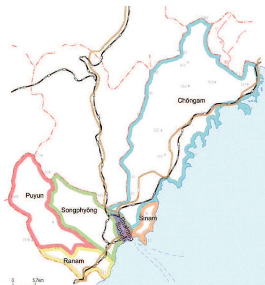
Figure Chongjin-III. Kuyok

The Pohang- kuyok (14 dong ), in which the eastern port of Chongjin is located, was founded in 1960 of the three dong of Namgang, Namhyang and Minju, although the latter was divided into the three dong of Chōngsong, Suwōn and Subuk, so that the kuyok consisted of five dong . In 1963, the dong of Namgang and Suwōn were divided into two parts each and the dong Chōngsong and Subok into three parts each. Pukhyang- dong was separated from Namhyang- dong . In 1967 Namgang3- dong emerged from parts of Namgang2- dong and Chōngsong1- dong . In 1972 Sanōp- dong emerged from parts of the neighboring Chongam- kuyok , where many factories are located. Sanōp- dong became part of the Pohang- kuyok . Therefore, 13 of 14 dong of Pohang- kuyok go back to three dong formed in 1955, which were split in 1960, 1963 and 1967.