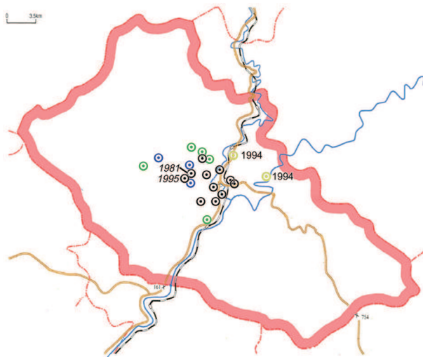
Figure Huichon-III. 21 dong (1995)

Kalhyŏn-ri in the northeast of the city each were established as a dong .