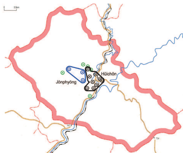
Figure Huichon-II. 17 dong (1967)

Between 1981 and 1995, four dong were added. As a result of the splitting from existing dong , Chuphyŏng2- dong and in 1995 Chŏngnyŏn- dong were created in 1981, both in the region of the former Jŏnphyŏng-rodongjagu, where the Huichon Ryŏnha General Machine Factory is located. In 1994, Chŏngha- ri as well as