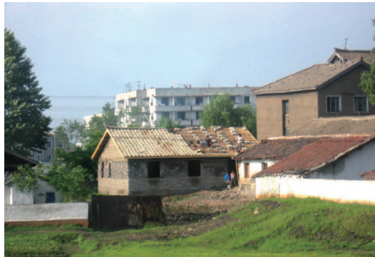
Figure Jongju-III. Building of a house (2006)