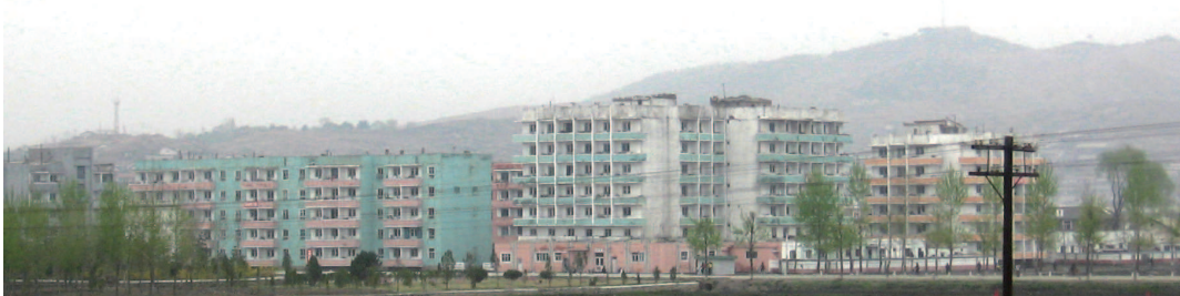
Figure Jongju-IV. Region west of the train station (2012)