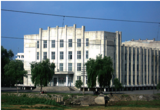
Figure Jongju-II. Youth Gymnasium (2006)

The Jongju Youth Gymnasium was opened in 1986, has a total area of 7,450 m 2 and has three floors. In the first and second floor are the spectator seats, which can hold 3,500 persons. For travelers, it is sort of a landmark of the city Jongju, because it is clearly visible from a train.