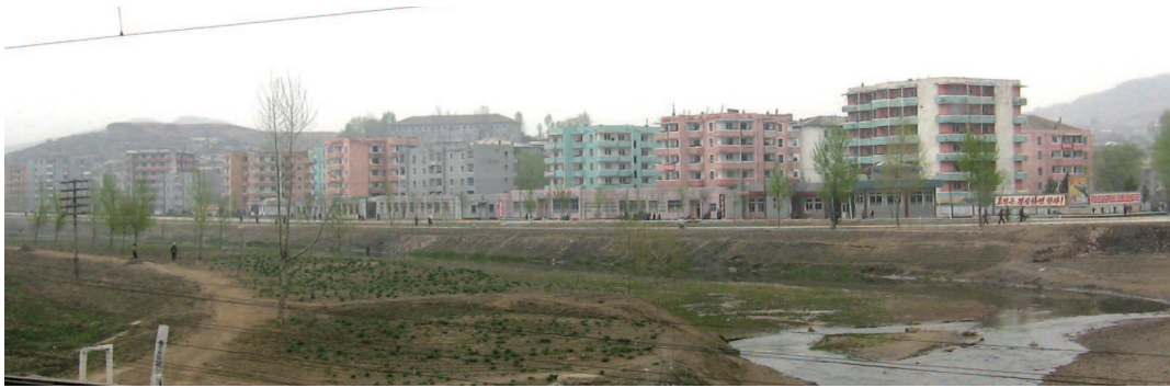
Figure Jongju–V. Region east of the train station (2012)